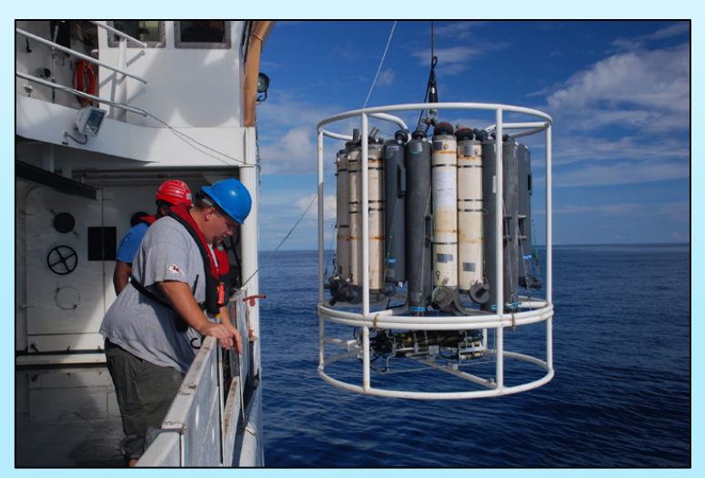
CTD rosette being deployed. CTD stands for Conductivity, Temperature, Depth measurement instrument.

The World Ocean Database is being used by scientists around the globe to study how changes in the ocean impact weather and climate. Scientists' access to millions of quality-controlled data sets is critical to the continuous monitoring of the changing ocean & climate.