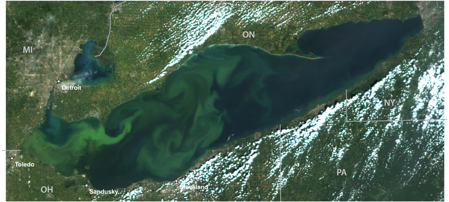
Figure 3. The maximum extent of the bloom on 6 September 2015 shown as a true color image. The bloom was less concentrated at this time than in August. Raw data was obtained from NASA's MODIS-Terra sensor.